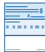
PAYROLL CHECKS/CHEQUES, DIRECT DEPOSIT RECEIPTS