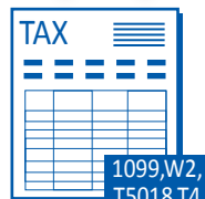
TAX FORMS 1099,W2, T5018,T4