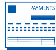
EXPLANATION OF PAYMENTS