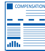
TOTAL COMPENSATION STATEMENTS