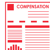
TOTAL COMPENSATION STATEMENTS