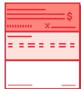
PAYROLL CHECKS/CHEQUES, DIRECT DEPOSIT RECEIPTS