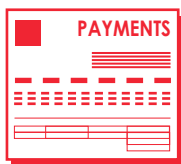
EXPLANATION OF PAYMENTS