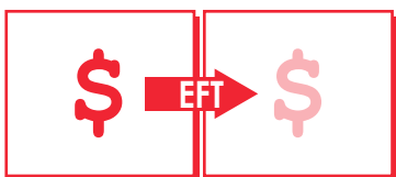
ELECTRONIC FUNDS TRANSFER