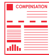
TOTAL COMPENSATION STATEMENTS